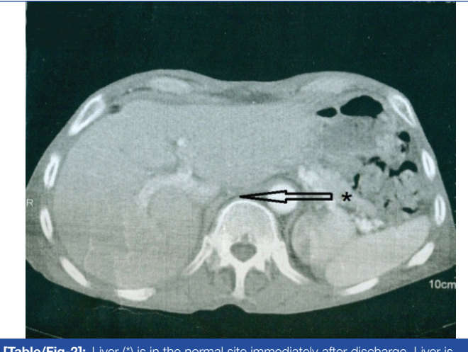
[Table/Fig-2]: Liver (*) is in the normal site immediately after discharge. Liver is decompressed.

After one year, all the liver function tests were normal and the patient was asymptomatic. Control CT scan after discharge was normal and no complaint was received from the patient.